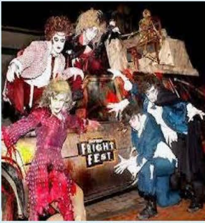
Fright Fest 2013