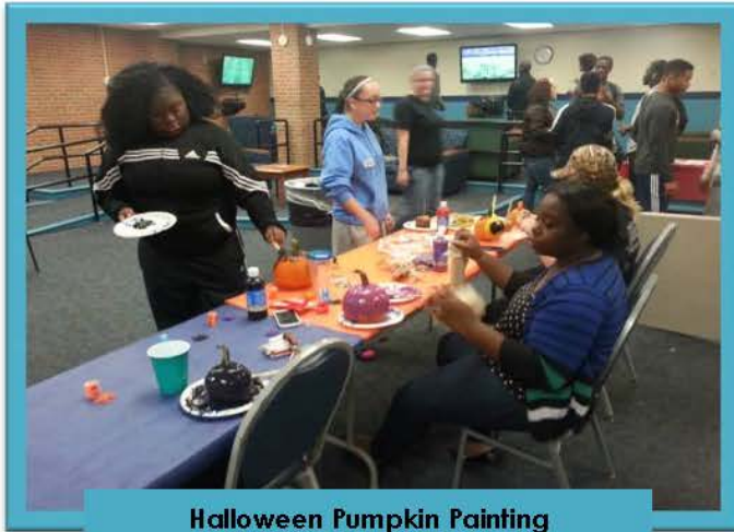
Halloween Pumpkin Painting