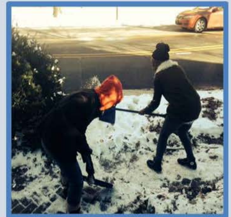
Wesley students shoveling snow in the community