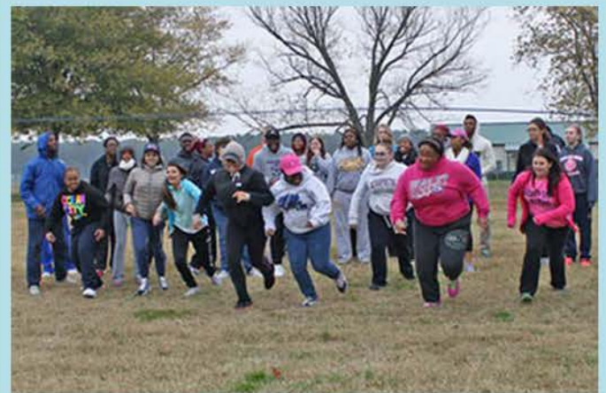
First Year Leadership Retreat at Camp Pecometh